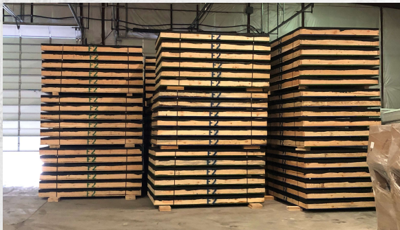
Roof & Floor Sections